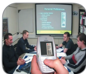
Figure 1: A mockup illustration, showing the envisioned scenario.

A mockup of this technology operating in the meeting room is shown in Figure 1. A participant can take a photo of a slide that is presented. Objects contained in the image can help to determine the topic of the presentation, and a user could retrieve previous presentations with similar content. An alternative application is a bookmarking service: An attendee takes pictures of slides (or parts of them) which are of interest to