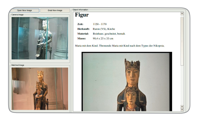
Figure 2: Interface of the object recognition application. On the upper left is shown the camera input image. On the lower left, the matched reference image is displayed. On the right hand side can be seen the browser window displaying the description of the object that has been associated to the matched reference image

During operation, our hand-held device allows the visitor to simply take a picture of an object of interest from any position and is provided, almost immediately, with a detailed description about it, see Figure 2. The visitor can also browse to some more specific information on the Intranet/Internet or to related objects that are currently exposed in the museum (e.g. made by the same artist). Furthermore, the visitor has the option to have the object description read out by the computer via a text-to-speech synthesis engine. This enhances the comfort by allowing the visitor to look at the exhibits instead of viewing the screen all the time.