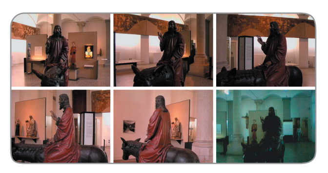
Figure 3: Sample of reference images and input image (lower right image) of an object in the museum. Note the important difference in appearance between the reference images and the input image.

Our interactive museum guide has been tested on 22 museum objects such as wooden statues, paintings, metal and stone items as well as coins and objects enclosed in glass cabinets, which produce interfering reflections. The input images were taken from substantially different viewpoints. The system uses a gray-scale image based algorithm that is invariant to changes in scale and in-plane rotation. Preparing the system to recognize additional objects is simple: a small set of reference images has to be added to the database, see Figure 3.