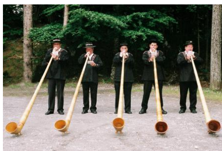
A bit of Swiss culture to host the workshop barbecue.