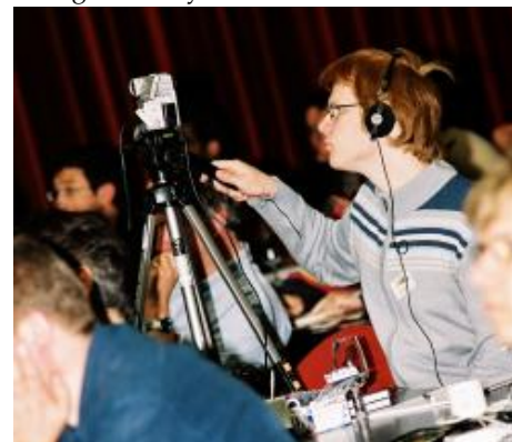
The whole workshop was recorded, to provide further raw material for meeting processing.

Based on the exceptional success of this first workshop, several candidates volunteered to organize the future MLMI workshops, which will all involve (IM)2 as one of the major players. NIST also expressed their interest to join MLMI and their "Rich transcription and meeting recognition workshop". Consequently, it has already been decided that the next MLMI'05 would be held in Edinburgh, jointly with the NIST workshop, while MLMI'06 would be organized by NIST and held in the US.