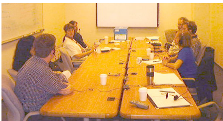
The smart meeting room in action at ICSI, www.icsi.berkeley.edu/Speech/mr .

The first stage in investigating speech recognition for meetings is to collect some data. At ICSI, we have equipped a meeting room with a multichannel, studio-quality recording system and have begun to collect pilot recordings of meetings, primarily between speech group members. At the time of writing (2001 February), we have collected 40 hours of 16 channel pilot data, and ten hours has been hand-transcribed. See this information on Meeting Recorder data collection including both the mechanics of the meeting recorder setup at ICSI and some initial forays into processing the recordings. The data were then transcribed, using a set of transcription conventions designed for speed and accuracy of data input and encoding.