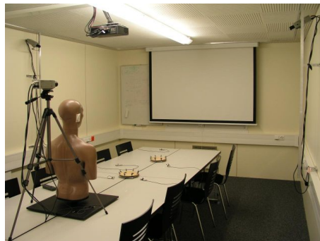
The smart meeting room setup at IDIAP, www.idiap.ch/moore/meeting .

Full details of the setup can be found in IDIAP Communication 02-07 ( www.idiap.ch → Publications).