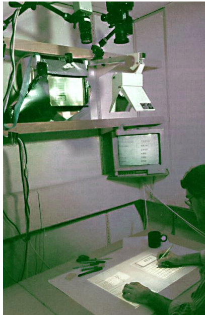
The original DigitalDesk setup, with camera and overhead projector.