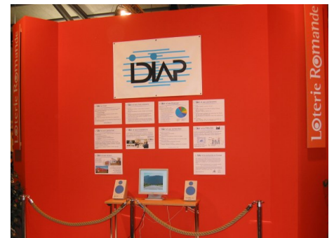
The IDIAP corner on the Loterie Romande booth during the 2003 edition of the Foire du Valais.

Being a non-profit, private research institute, IDIAP has benefited for several years of the support from the Loterie Romande, www.loterie.ch , to account for a part of the costs not covered by research grants. Even though this contribution only amounts to a few percent of the annual budget of IDIAP, it is nevertheless a key element of the Institute's activity since it helps pay for basic support such as furniture, computing servers or networking equipment.