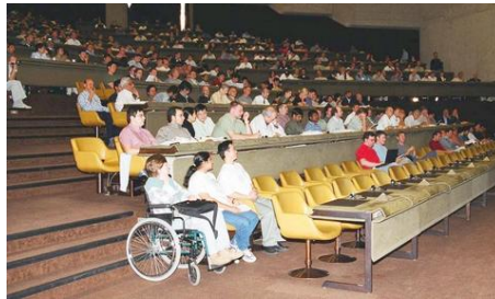
The Eurospeech'2003 audience.

multi-disciplinary areas such as: phonetics and phonology, speech production, speech perception, acquisition, learning and pathology of spoken language, discourse and dialogue, signal analysis, processing and feature estimation, speech coding and transmission, speech recognition and understanding, speech generation and synthesis, spoken dialogue systems, multimodality, resources, assessment and standards.