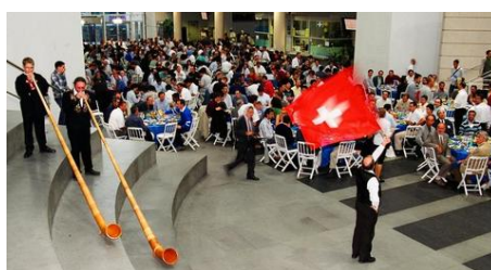
A hint of traditional Swiss culture at the banquet dinner in the UniMail building.