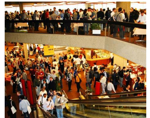
The participants socializing in the CIGG.